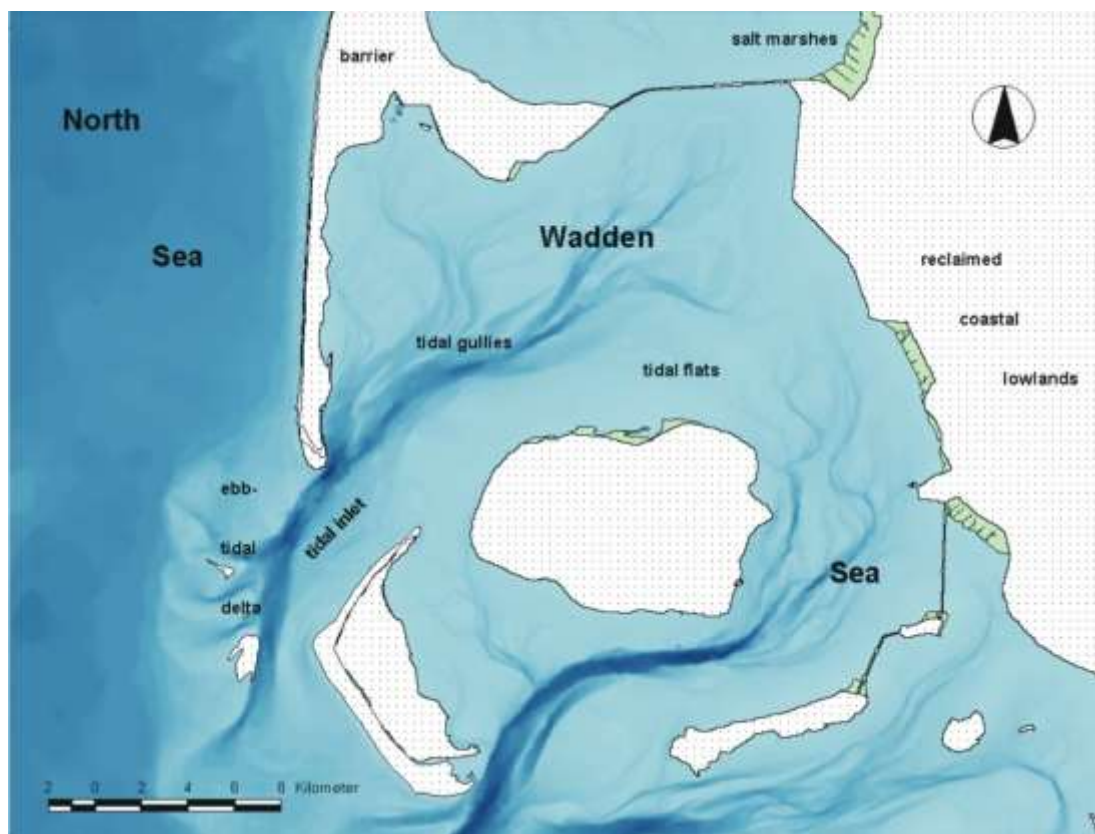
Figure 3. Tidal basin with typical morphological elements

Each tidal inlet system with its morphologic elements (salt marshes, tidal flats, tidal gullies, barriers and ebb-tidal deltas; see Figure 3) can be viewed upon as a sand-sharing system. All elements of the system are coupled and can be in, or strive towards, a dynamic equilibrium with the hydrodynamic conditions. Changes in any part of a tidal inlet system will primarily be compensated by sediment transport to or from the other parts of the same system. When changes are temporary and limited, the old dynamic equilibrium will eventually be restored. For example, a moderate increase in sea level rise induces a stronger accumulation on tidal flats and salt marshes as a result of longer tidal inundation (i.e., the sediment having more time to settle). As a result, the elevation of the flats and salt marshes increases and the time of tidal inundation decreases again until the old dynamic equilibrium is restored. An indication for this is that the morphological state of the system correlates well to the hydrodynamic conditions. This is exemplarily illustrated by the following relations: